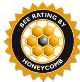
Verification Manager Honeycomb BEE Ratings